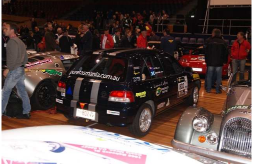
The cars parked in Parc Ferme at Launceston

The rally was to be run over 6 days, 4 of which were on roads centred around Launceston in the north, the 5<sup>th</sup> was spent driving down to Strahan in the south west, and then the final day crossing the island from Strahan to Hobart where the event finished. Altogether some 2000km of driving with 600km of closed road tarmac stages. Apart from Day 0, we would have 8 stages to run each day and these varied in length from about 5km to 53km long.