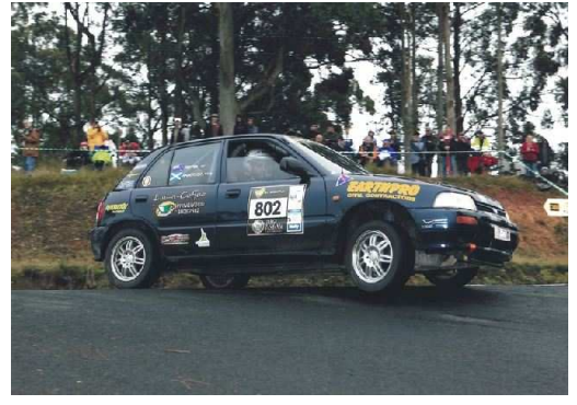
Yes, charades can get airborne

Mount Roland was the 5<sup>th</sup> stage of the day and was 26km long and designated as 'wet'. It was wet when we started but dried out as we negotiated a series of sharp hairpins uphill, overtaking cars including a BMW 325 on route! Taking hairpins uphill is all very good but the other side of the hill has also to be negotiated, but down the way! More scary stuff. Notes from the day say that I was getting used to the pace notes, how and when to call them, and when to repeat the call with the right tone of urgency in the voice.