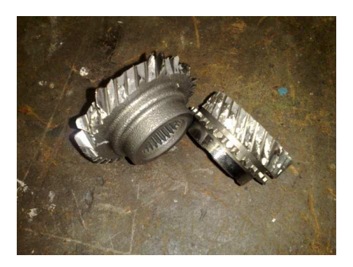
The stuffed 3<sup>rd</sup> gears

Simon, our service and engine development manager, arrived early on the Wednesday morning, removed the box and discovered, attached to the internal magnet were all the teeth from the 3<sup>rd</sup> gear – totally stripped. Once again our supply of spare gears came to the rescue and the gearbox was cleaned, reassembled and installed into the car by the Wednesday night.