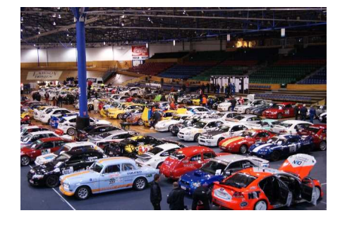
Parc Ferme in the Silverdome

Saturday pm we arrived in a cold Melbourne and had a few hours to wait until loading onto the overnight ferry to Devonport. A fine excuse for some light refreshments before the week of supposed abstinence.