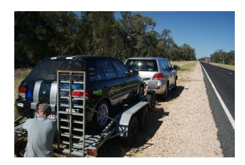
Re-tying down the car on route

Friday morning we set off for Melbourne with the service barge (the Landcruiser) towing the rally car and Ian's Z4 following in convoy. A long boring journey with speed limits generally not exceeding 100kmh on primarily single carriageway roads which are very closely monitored by police patrols along the route.