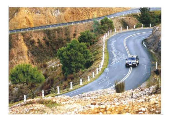
Queenstown Stage - the stage was 6.4 km long and we averaged 72kmh - a slow stage

As the conditions were wet we had 35 minutes to complete it in, and in fact achieved it in 33 minutes, but although it felt as though we had good grip, lan did mention afterwards that it was very slippy!