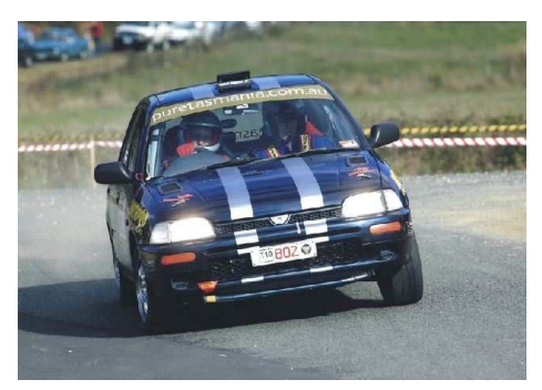
Working the suspension hard

We had one moment on the Cethana stage, the 2<sup>nd</sup> stage, which was a reverse of Mt Roland but also continued for a further 15km. Conditions were very slippy, with drizzle at the start, low mist on the top of the hill and then gradually drying out as we went through the hairpins at the descent. We had also overtaken several cars on the ascent of the hill – a Porsche 911, jag, BMW again plus others. A long 6 right, and the camber caught the rear of the car out, but it was expertly controlled by lan (with a few turns of the steering wheel left and right) and off we went. I spent those split seconds deciding which tree looked the softest to land against. I also did note that there were several groups of spectators on the corner – a clue perhaps!