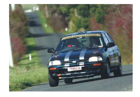
Me driving in Longford